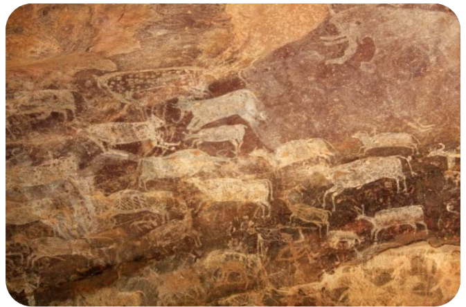
Bhimbethka rock shelter