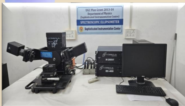
Spectroscopic Ellipsometer (14/02/2025)