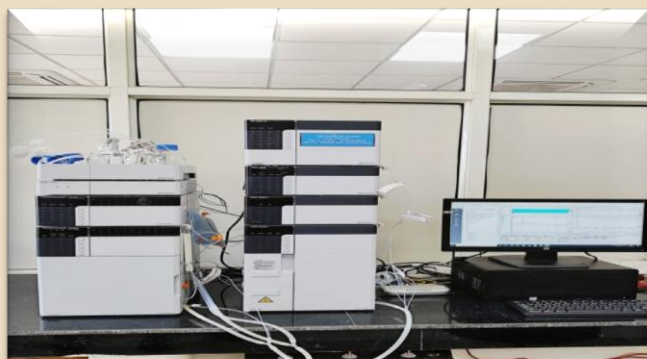
Ultra-Performance Liquid Chromatography (UPLC) (11/02/2025)