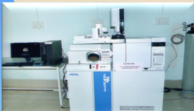
Gas Chromatograph-Mass Spectrometer (GC-TOF-MS) (19/02/2025)